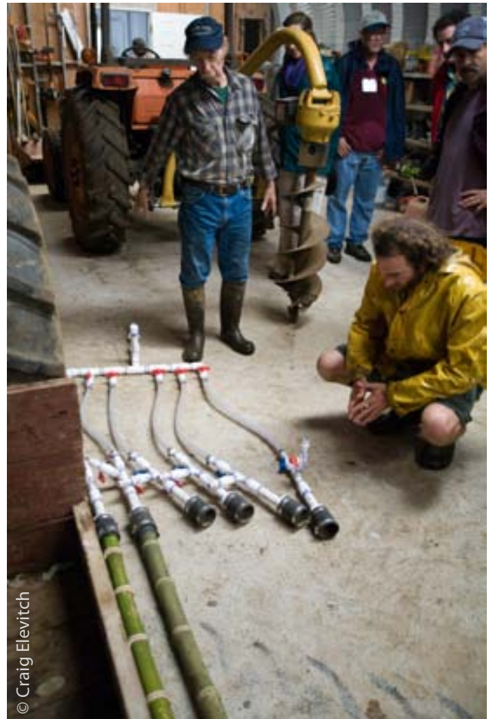
A simple farm-scale pressurized treatment system in North Hilo, Hawai'i.

Primary and secondary processing can be easily done at a community level and there are a huge range of types of products, from those produced in large quantities with low individual value (for example incense sticks, chopsticks, and bamboo mats) to those that involve more skill to produce,