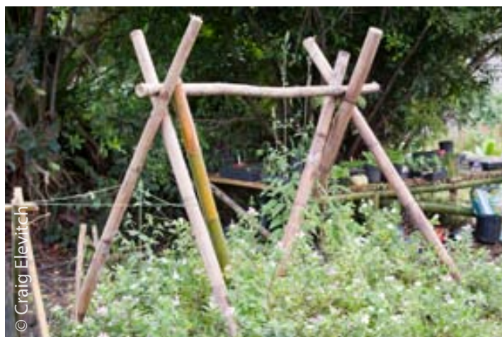
Simple garden structures made of bamboo poles, Hāmākua, Hawai'i.

Bamboo can be used to replace a wide range of imported goods including construction materials, charcoal, household items, and so on. Locally grown bamboo shoots can help reduce reliance on imported vegetables.