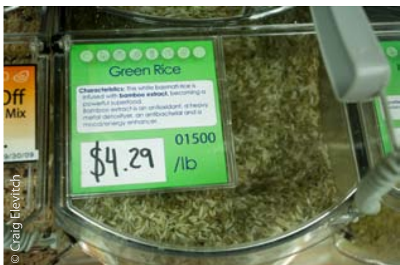
Top: "Bamcat" measuring 4.8 m long has bamboo hulls that each weigh only 19 kg (crafted by Gary Young). Middle: Beer made with bamboo flavoring. Bottom: Rice flavoured with bamboo extract.