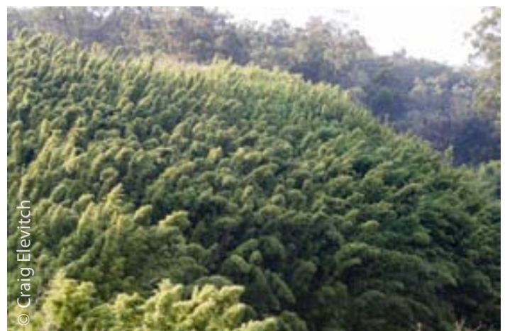
Invasive monopodial bamboo covering a hillside, Maui, Hawai'i.