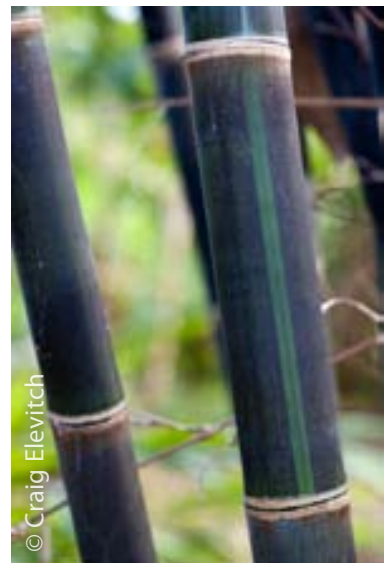
Top left: A open structure built from framework covered with canvas, North Kona, Hawai'i. Top right: Conventional architecture with bamboo structure and trim, North Kona, Hawai'i. Bottom left: Many bamboos are both highly ornamental and very useful. Otatea acuminata makes a beautiful hedge to 4 m in height, while also providing usable canes and edible shoots, South Kohala, Hawai'i. Bottom middle: Gigantochloa maxima . Bottom right: Culms of Dendrocalamus asper 'Betung Hitam'.