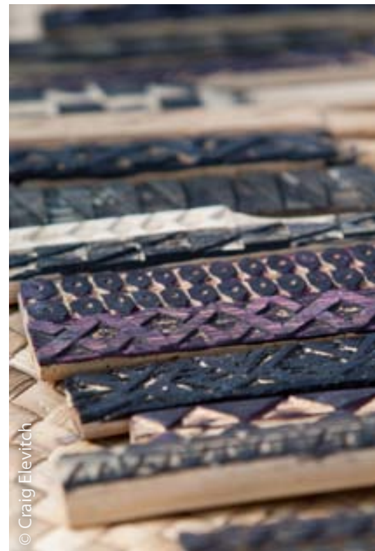
Left: Schizostachyum glaucifolium is native to some Pacific islands and widely introduced to others by ancient Polynesians. South Kohala, Hawai‘i. Middle: Traditional Hawaiian nose flute (ʻohē hano ihu) made from Schizostachyum glaucifolium . Right: Traditional Hawaiian bamboo pattern stamps (ʻohē kapala) for decorating tapa cloth.