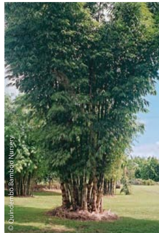
Three promising species used for construction timber and edible shoots. Left: Gigantochloa atter . Middle: Bambusa lako (lesser timber quality). Right: Dendrocalamus asper 'Betung Hitam'. All photos from North Hilo, Hawai'i.