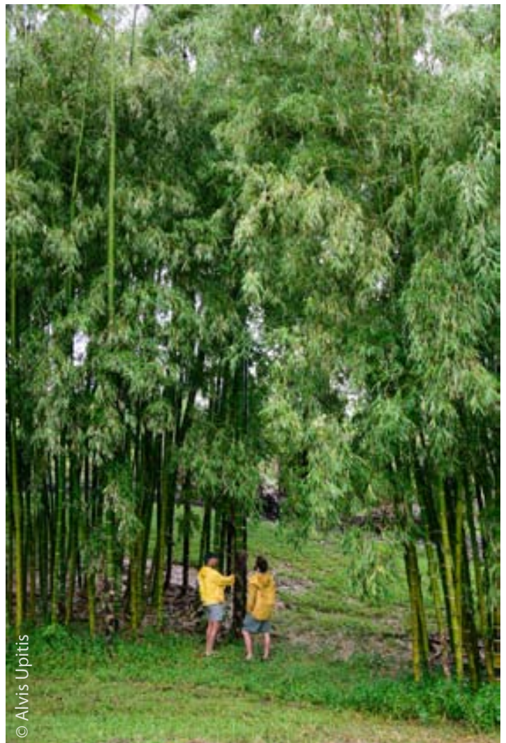
Left: Dense clump of Dendrocalamus asper in need of thinning, North Kona, Hawai'i. Right: Open stand of Guadua angustifolia in North Hilo, Hawai'i.