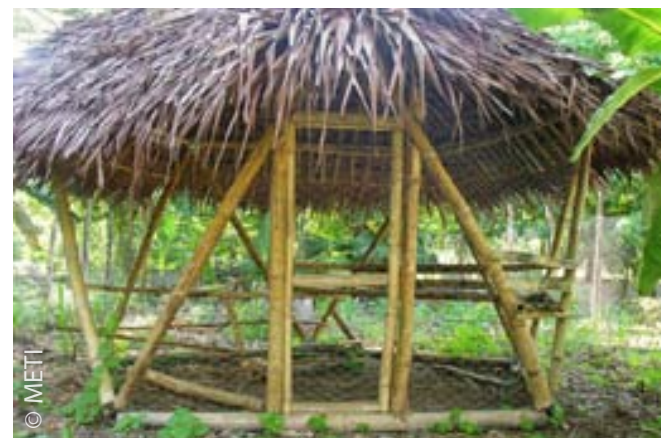
A number of species are being trialed at the METI mother plant plantation established in 2006 at Vailele, Samoa. Left: Bambusa oldhamii . Middle: Dendrocalamus asper . Right: Simple structure made from bamboo and eleven low-tech metal fittings.