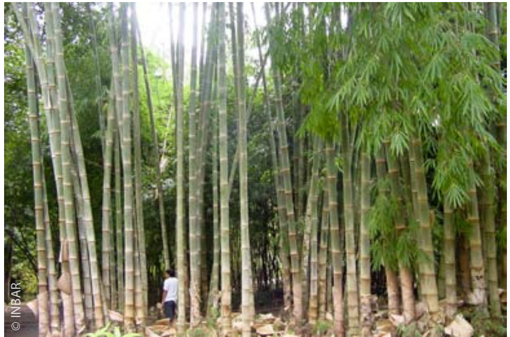
Left: Guadua angustifolia culms, North Kona, Hawai'i. Right: Guadua sp., Ecuador.

Tropical clumping bamboos often have broad climatic tolerances, although the vast majority are sensitive to frost. Minimum annual rainfall of about 600 mm is adequate for some species, but most prefer 1,200 mm or more.